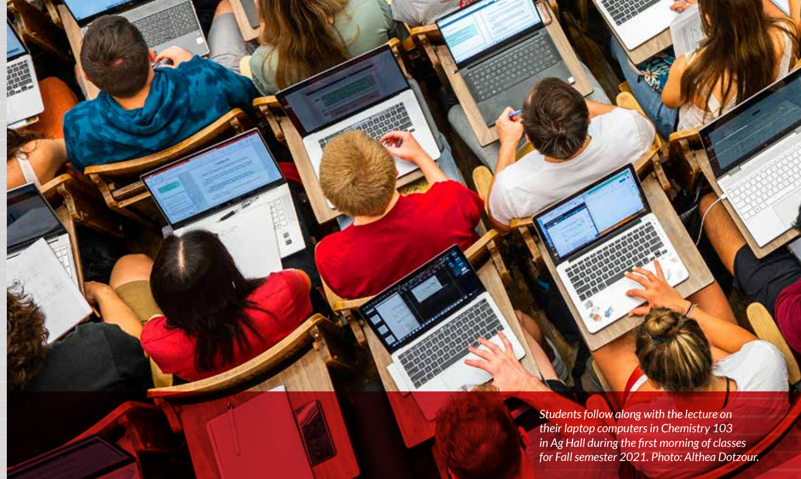
Students follow along with the lecture on their laptop computers in Chemistry 103 in Ag Hall during the first morning of classes for Fall semester 2021.