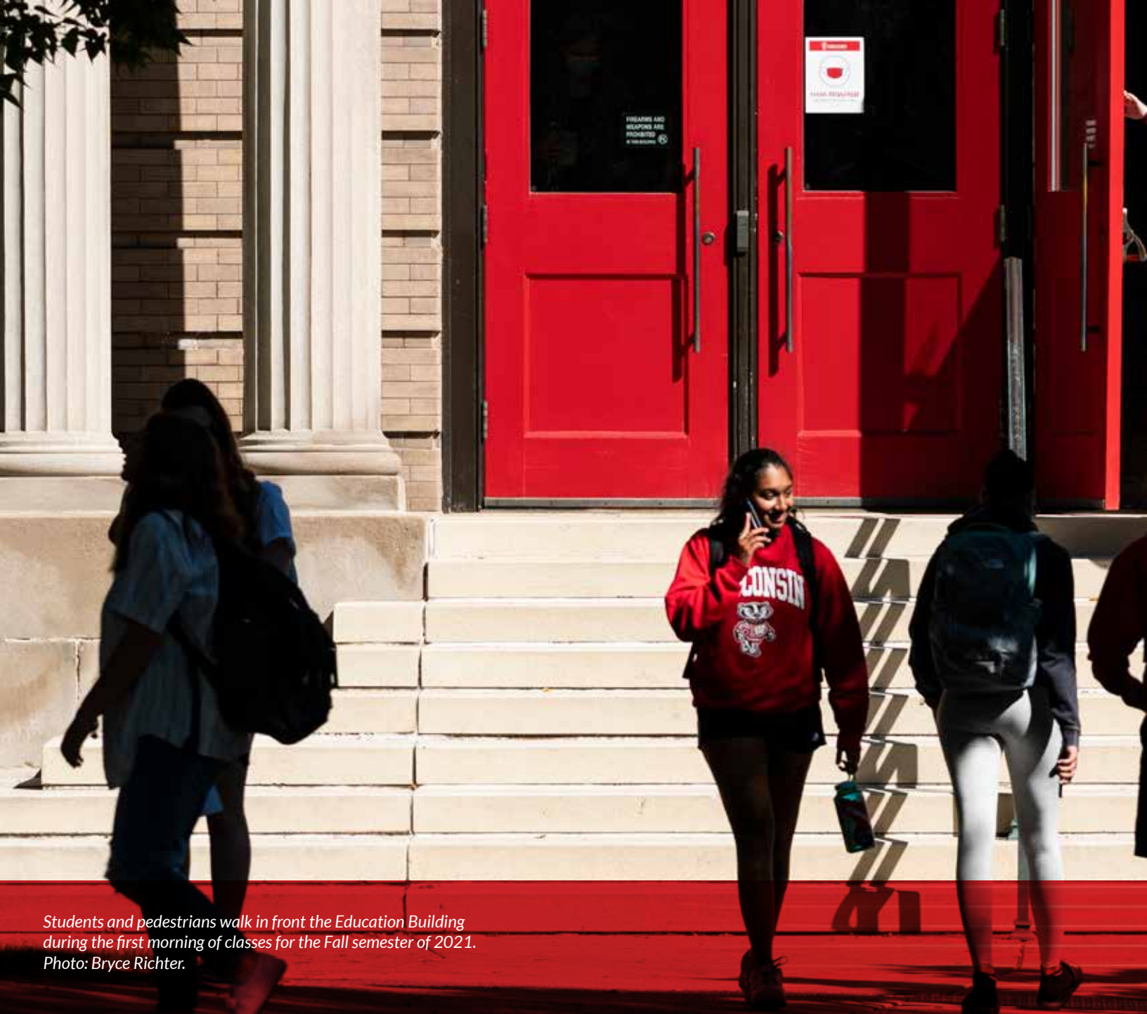
Students and pedestrians walk in front the Education Building during the first morning of classes for the Fall semester of 2021.

■ We are partners in promoting your student’s success at UW–Madison. Together, we can get students the help they need and create an environment where they feel supported.