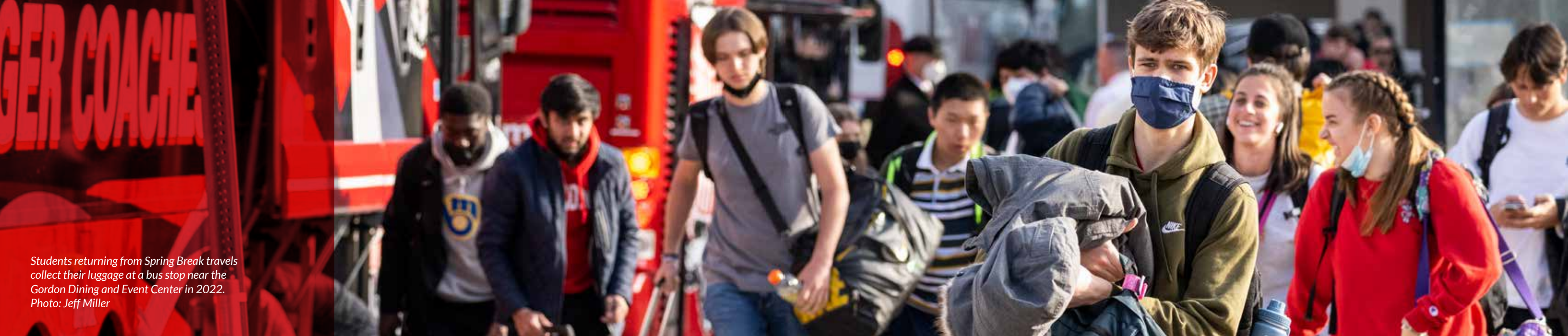
Students returning from Spring Break travels collect their luggage at a bus stop near the Gordon Dining and Event Center in 2022.