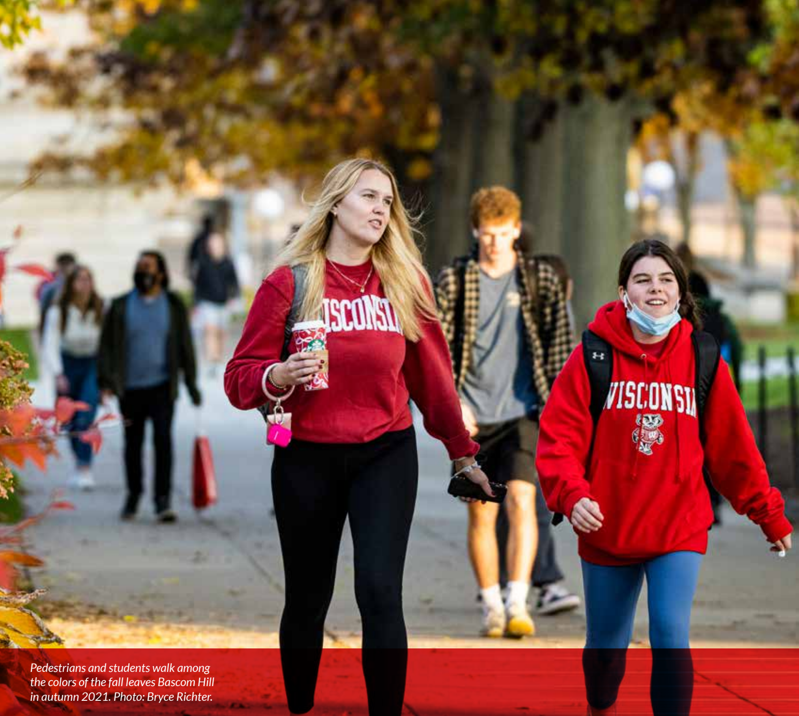
Pedestrians and students walk among the colors of the fall leaves Bascom Hill in autumn 2021.

■ Resources to support student health and wellbeing are available, often at no-cost, on campus. However, students may also access services in the surrounding community.