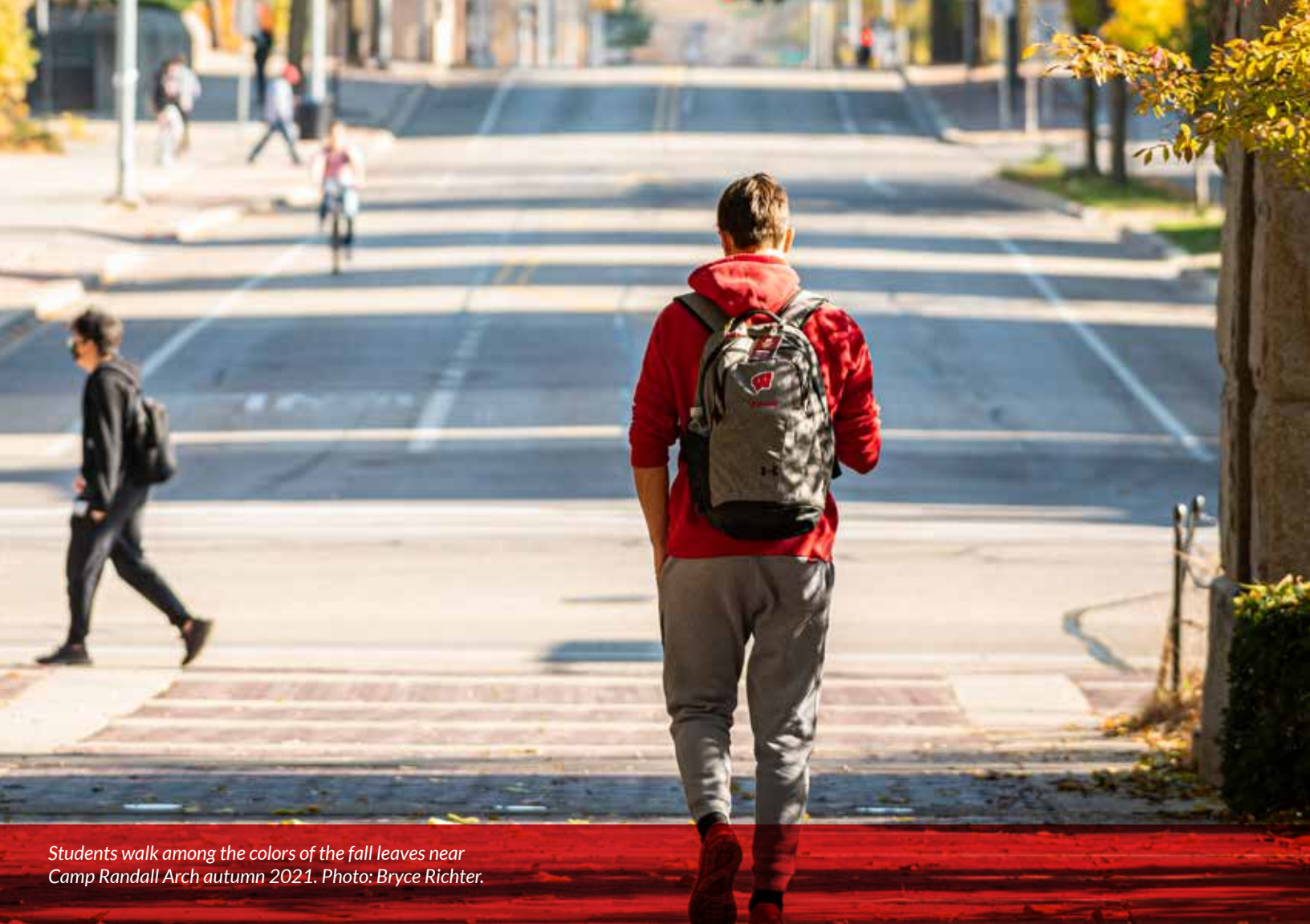
Students walk among the colors of the fall leaves near Camp Randall Arch autumn 2021.