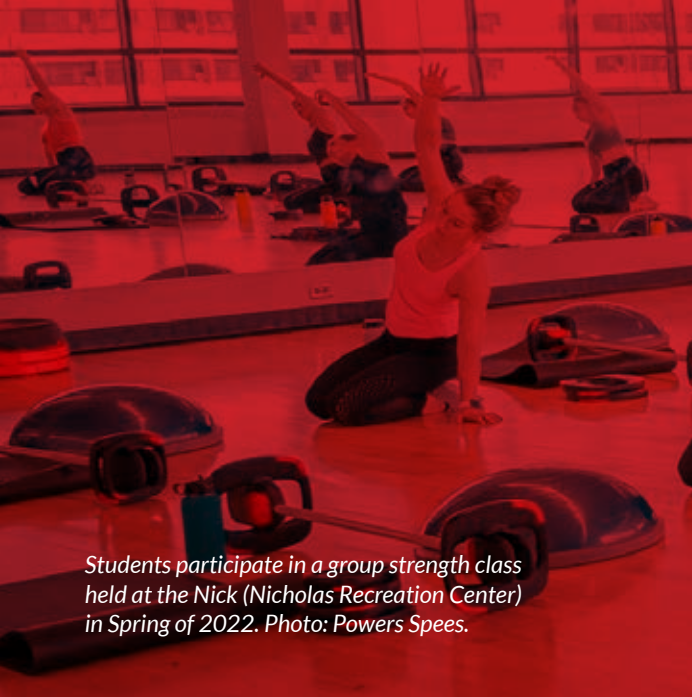
Students participate in a group strength class held at the Nick (Nicholas Recreation Center) in Spring of 2022.