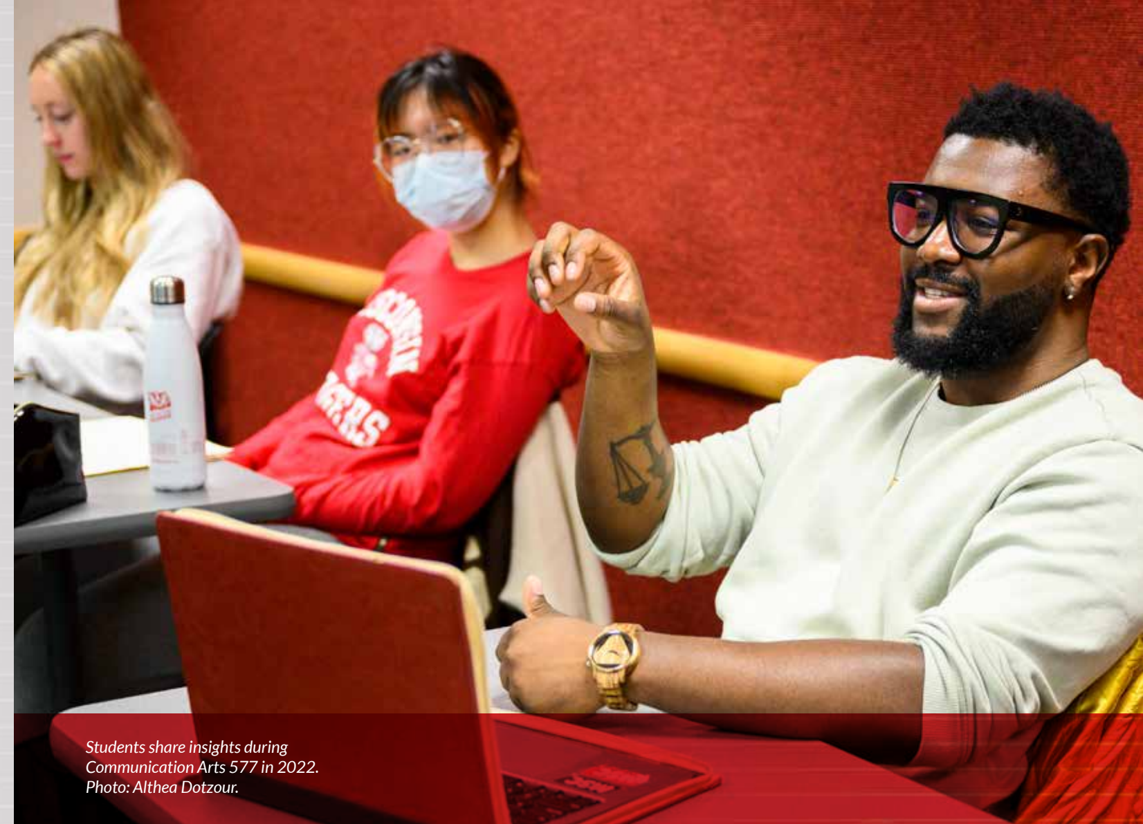
Students share insights during Communication Arts 577 in 2022.

More than half of students who screened positive for significant symptoms of anxiety and/or depression have received professional mental health treatment. 1