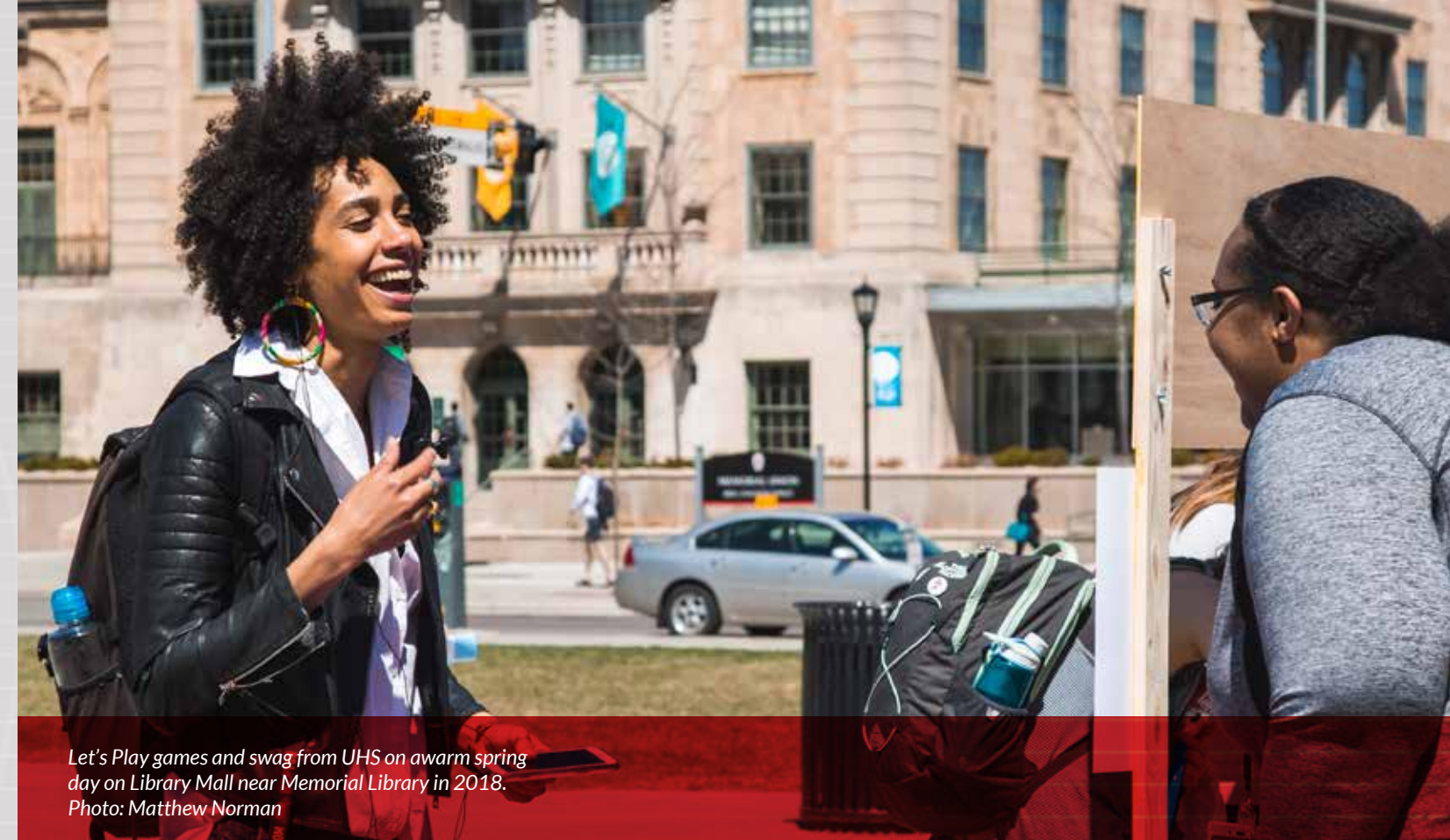
Let's Play games and swag from UHS on awarm spring day on Library Mall near Memorial Library in 2018.

The online program Suicide Prevention Training for UW–Madison Students includes modules on recognizing warning signs in peers, responding effectively, and referring to resources. All students can access this program in Canvas.