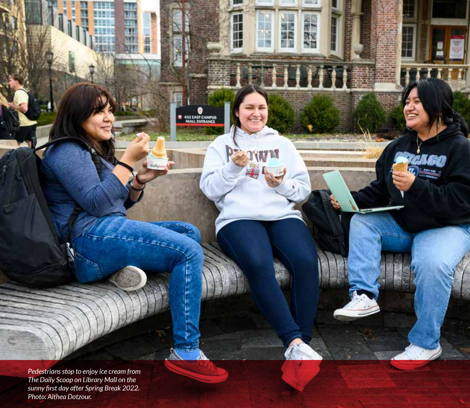
Pedestrians stop to enjoy ice cream from The Daily Scoop on Library Mall on the sunny first day after Spring Break 2022.