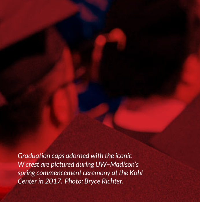
Graduation caps adorned with the iconic W crest are pictured during UW–Madison’s spring commencement ceremony at the Kohl Center in 2017.